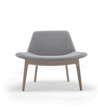
Sculptural wood bases bring warmth and visual comfort to spaces

The Current Lounge Seating was the starting point for the entire Slide Collection, pieces that are mobile, comfortable, and flexible to suit the way we work now. David MocarSKI designed the lounge chair with extended "wings," providing a generous scale and flexibility in ways of sitting, from casual to formal and even cross-legged.