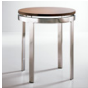
Round side table with wood top and Polished Stainless Steel base

A striking table, the Venlo is part of the permanent collection on display in the New York Museum of Contemporary Art. Created by expert steel craftsmen, these tables feature clean lines and bold forms that are characteristic of styling that is versatile and timeless.