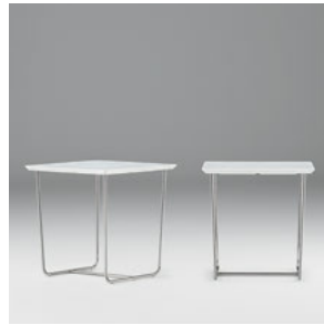
Current side tables have a clean silhouette and surface options

Current occasional tables are lightweight and movable, yet stable and durable, as they need to be for Slide Collection environments for the way we work now. Coffee and side tables have clean silhouettes, and a pull-up table snugs up to seating for a handy computer, note-taking, or coffee cup surface.