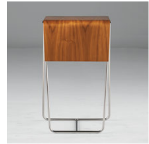
The bent-wood surface of the pull-up table provides balance areas