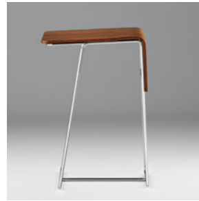
The pull-up table is a highly versatile addition to casual meeting areas